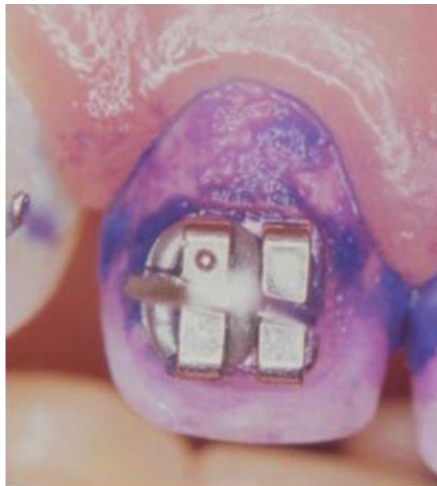
Figure 1 Image of a lateral incisor with disclosed plaque showing the aligning jig in the bracket slot

Six weeks later, at the first adjustment appointment, the elastomers on the upper incisors and lower canines were removed. The teeth were disclosed with a disclosing agent (Plaque Finder™, Rotadent, St Neots, PE13 3TP, UK) the patient rinsed out for at least 30 seconds. Self-retaining cheek retractors were placed. A jig constructed of 0.021 × 0.028 inch stainless steel wire was placed in the bracket slot and an elastomeric ligature used to hold it in